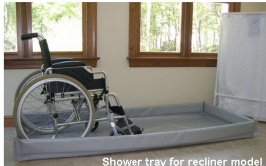
Shower tray for recliner model