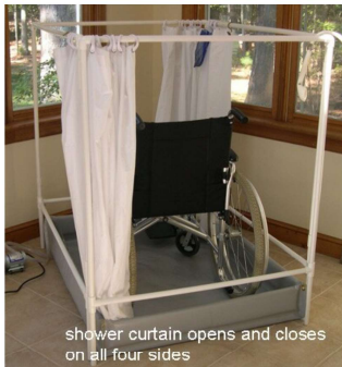
shower curtain opens and closes on all four sides