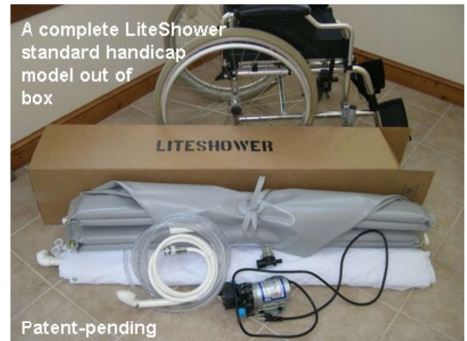
A complete LiteShower standard handicap model out of box